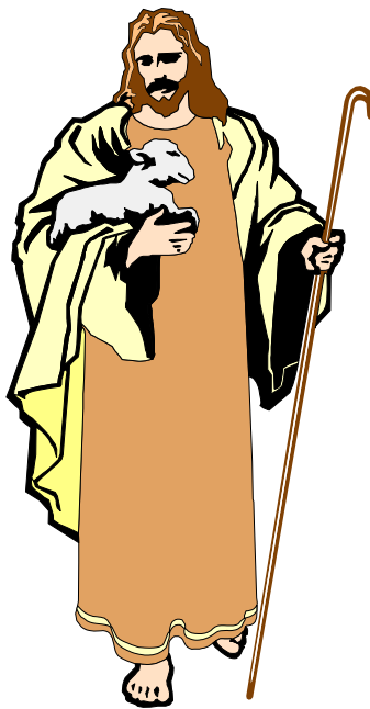
Tending the flock for 103 years